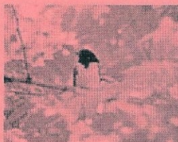
Palmyra Cove Nature Park

And now, in addition to visiting selected sites, including museums, nature centers, and historic sites, you can accumulate points towards certificates of Participation, Achievement and Merit and prizes tailored to each level.