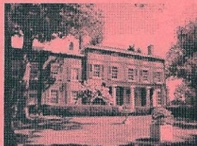
Historic Smithville Mansion

No need to travel far to visit interesting museums, enjoy nature and learn about fascinating history. Its all right here in Burlington County — in your own backyard!